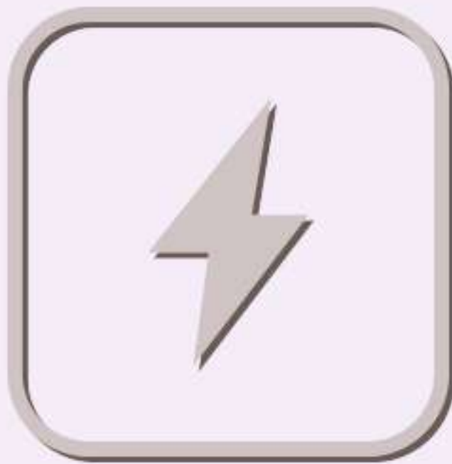
low curing time