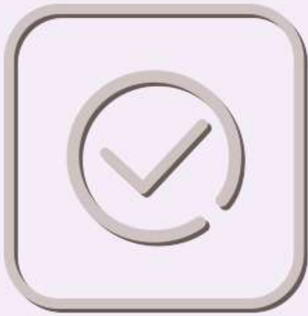
high cost performance